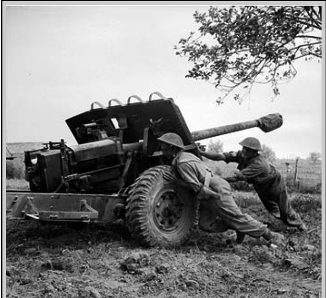
Gun crew of 267 Battery, 67 Anti-Tank Regiment, Royal Artillery prepare a 17 pounder Pheasant anti-tank gun for action Imperial War Museum NA 6685

Saturday, September 11<sup>th</sup>, 1400 hours: II/64 Panzer Grenadier Regiment and Panzer IVs of the II/2.Panzer Regiment of 16.Panzer Division attack the positions held by the 167<sup>th</sup> Brigade. Despite